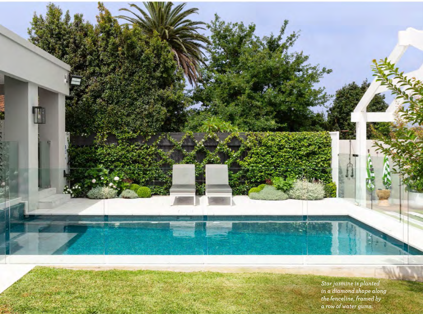
Star jasmine is planted in a diamond shape along the fence line, framed by a row of water gums.