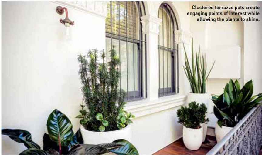
Clustered terrazzo pots create engaging points of interest while allowing the plants to shine.