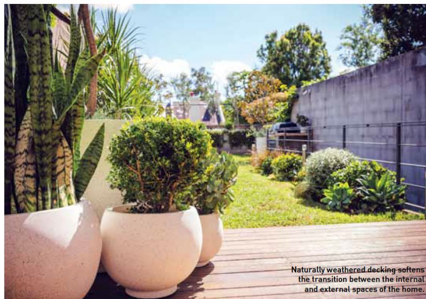
Naturally weathered decking softens the transition between the internal and external spaces of the home.

The Victorian property was in a sad state before renovations reanimated the home. Unfortunately, though, renovation work meant