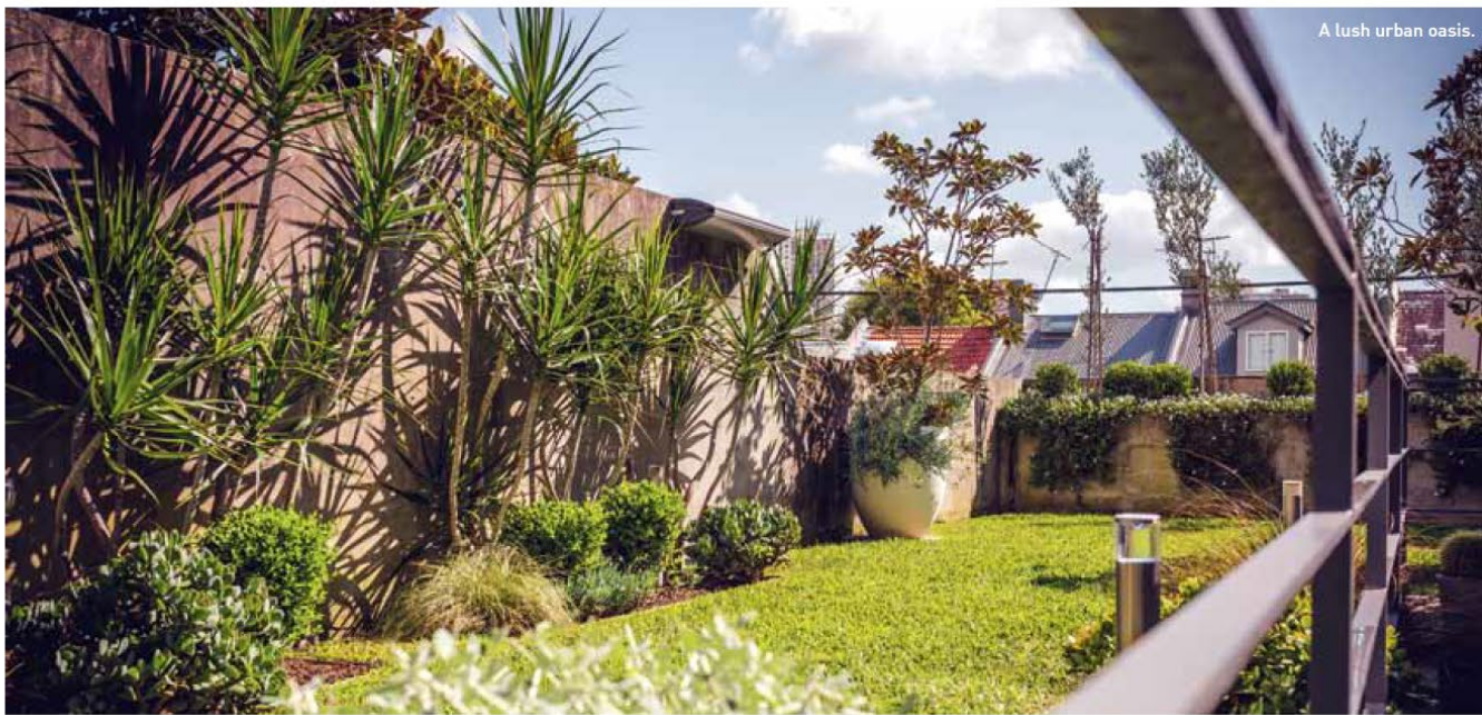
A lush urban oasis.

Modern outdoor furniture adds functionality to the balconies.