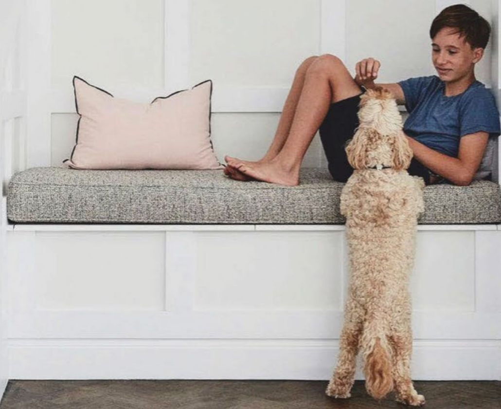
Flowers throughout from Emporio Home & Flowers, Manly, NSW; northsteynemporio.com.au .

Flow Interiors & Styling , Mosman, NSW; flowinteriors.com.au . JSM Construction , Newport, NSW; jsmco.com.au . Garden Society , Narrabeen, NSW; gardensociety.com.au .